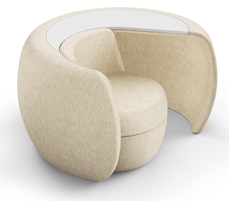
TOOthePOINT SOLO right

Combine multiple TOOthePOINT to create an informal meeting space.